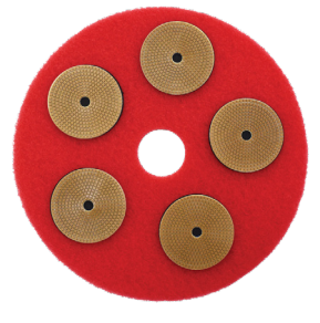
Standard Floor Pad with 5" PowerPolish Discs and Adaptor Pads