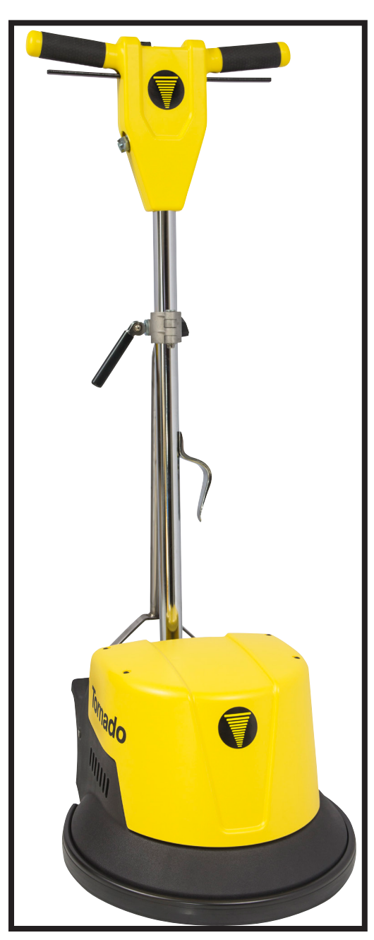
BRUTE FORCE SERIES FLOOR MACHINES 17" and 20" MODELS MODEL NO: 97561 and 97564

Operations & Maintenance Manual For Commercial Use Only